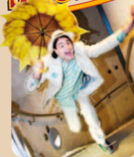
Douglas Dapper

Using exhibits and artefacts, in a variety of new and imaginative ways, Douglas Dapper guides you on a magical treasure hunt to discover an exciting collection of stories from around the world.